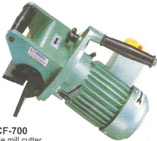
VCF-700 Side mill cutter