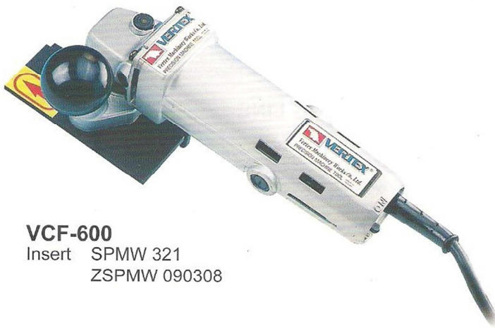
VCF-600 Insert SPMW 321 ZSPMW 090308